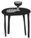
Table to Table: A question for kids and adults to answer together.

Did God make governments and nations? Does he use them to do good things in the world? Do they always do what God wants them to do?